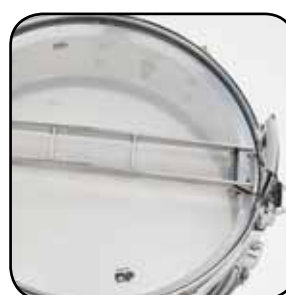
Snare Bridge™ System