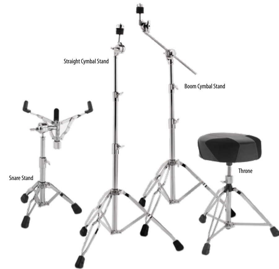
Straight Cymbal Stand