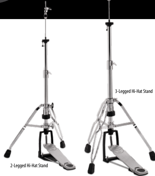
2-Legged Hi-Hat Stand

At the center of the all-new line of Concept Series™ is an innovative toothless QuickGrip™ clamp that allows drummers to add mountable percussion instruments, cymbals, accessories, and even microphones, without the need for additional stands. It also gives players the ability to customize just about any existing stand in a myriad of ways. The sturdy, all-metal-constructed clamp is outfitted with a friction disc that offers infinite adjustment, while the versatile design means that the ½" factory set clamp can be quickly and easily converted to 10.5mm by flipping over the drum key brake on either end. This means that QuickGrip™ clamps and accessories can be used with DW and PDP arms, as well as most other brands on the market today. You can now utilize the backs of cymbal arms, floor tom legs, and tops of tom arms to customize like never before. To see the full line of all-new Concept Series™ pedals, hardware, and accessories visit: www.dwdrums.com