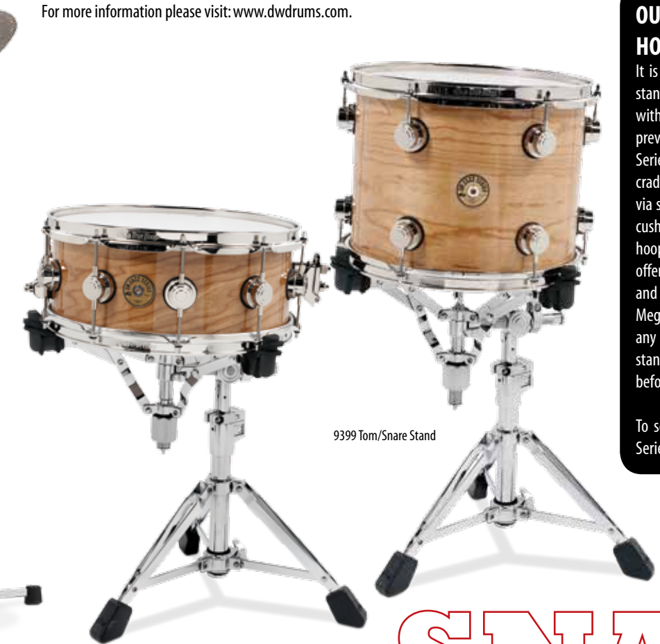
9399 Tom/Snare Stand

It is more common than ever to see a rack tom mounted in a standard snare basket. The idea has been around for years and with the growing popularity of vintage drums, it's even more prevalent today. That's the reason we now offer the DW 9000 Series tom/snare stand. The beefy 9399 specializes in securely cradling rack toms by offering increased isolation and resonance via specially-designed Neoprene® pads. These soft pads act as a cushion between the basket's crutch tips and the drum's counter hoop, while gripping tightly for stable, solid play. The stand also offers a patented removable, offset basket for easy positioning and quick snare changes. The larger footprint is courtesy of a Mega-Tripod™ base that gives the 9399 the largest footprint of any DW snare stand. The result is a heavy-duty, road-worthy stand that gently supports rack toms and snare drums like never before.