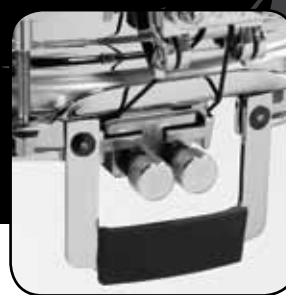
Snare Bridge™ Fine Tune

For more information please visit: www.dwdrums.com .