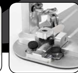
Tri-Pivot™ Swivel Toe Clamp