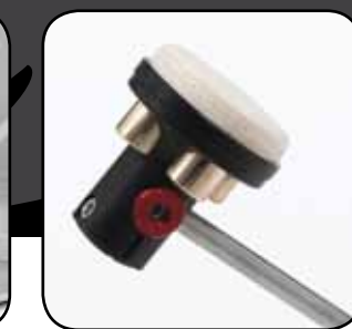
Control™ Adjustable Beater

Industry-standard bass drum pedals have always been a DW mainstay. The all-new MDD (Machined Direct Drive) Pedal is no exception. Jam-packed with a slew of drummer-friendly features, the MDD is machined from solid aluminum and is the result of years of painstaking design and engineering. The ultimate goal is to offer players unprecedented feel and versatility, whether they currently play a direct drive pedal, or not. In doing so, an Optimized Fulcrum Geometry™ linkage was developed to offer smooth, effortless action with just the right amount of beater throw. Other standard features include: a newly-designed, solid aluminum, perforated footboard with a contoured heel plate, interlocking Delta™ hinge, TBT™ (Threaded Bearing Technology) in the drive linkage and cam, Tri-Pivot™ swivel toe clamp, solid aluminum direct drive cam with pivot adjustment, Vert™ (Vertical Sliding Spring Adjustment), Control™ beater with adjustable weight/impact, and more. In addition, the double pedal offers a lightweight single-post auxiliary pedal and a patented AB™ (All-Bearing) zero-backlash universal joint.