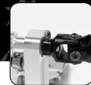
AB™ All-Bearing Universal Joint