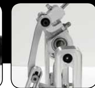
Optimized Fulcrum Geometry™ Linkage